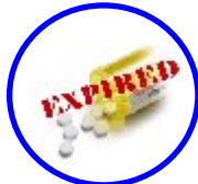
OUT OF DATE PRODUCTS